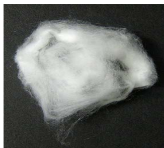
Fig. 2: Appearance of Bone Cotton Wool; the new implant material is highly bioactive and easy to shape.

Currently the new implant material is tested in vivo in an animal model.