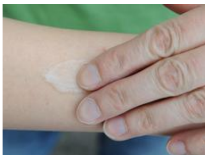
Fig. 1: A subcutaneous gene network can be controlled and adjusted by applying a skin cream containing the inducer phloretin.